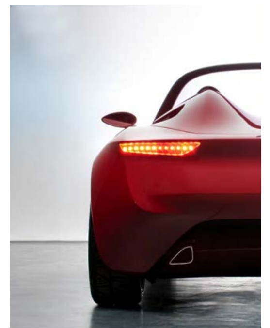
"Italian style means sense of proportions, simplicity and harmony of line, such that after a considerable time there is still something which is more alive than just a memory of beauty."